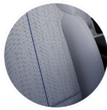
SKY COOL GRAY

Perforated Inteluxe seating with backlit Dark Ash Cluster open-pore wood trim